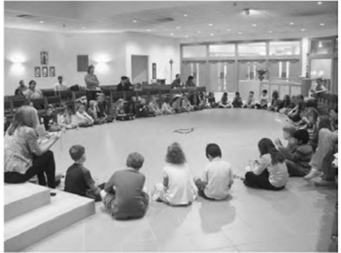
CFP Living Rosary, October 9, 2016

Today, we are taking up the second collection for the Catholic University of America. Established by the Vatican and the U.S. bishops in 1887, it is the national university of the Catholic Church. It is proud to have nearly one third of the U.S. bishops as alumni, along with over 12,400 living priests and religious from around the world. In Washington, DC the university provides an education based in Catholic intellectual tradition to nearly 7,000 students through its 12 schools – that include arts & sciences, music, engineering, philosophy, social work, law, and business in addition to ecclesiastical degrees in canon law and theology. Your support will enable Catholic University to expand its impact in preparing the next generation of leadership for our Church and nation. We appreciate your generosity. You can learn more at collection.cua.edu .